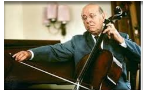
Legendary cellist Pablo Casals was asked why at 93 years old he still practiced 3 hours daily. He replied, "I am beginning to see some improvement."